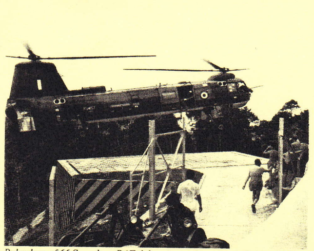
Belvedere of 66 Squadron RAF delivering radar parts to Penang Hill.