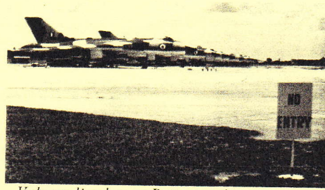
Vulcans lined up at Butterworth