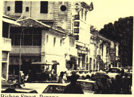
Bishop Street, Penang.

SEE ALSO DETAILS OF AN ASSOCIATION REUNION TRIP TO SINGAPORE AND MALAYSIA ON PAGE 3 - URGENT REPLIES REQUIRED TO THAT TOO!!!! - SEE PAGE 9