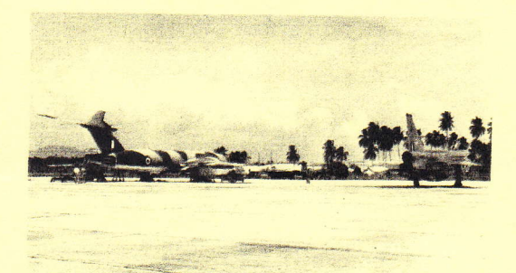
Victor and Lightning at Butterworth