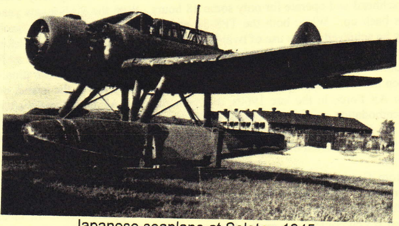
Japanese seaplane at Seletar, 1945.

Removing the propeller was the next problem as neither of us had any experience with aircraft, my trade being that of Fitter General, i.e. ground equipment, bench work etc. We reasoned that removal of the spinner should disclose the method of attachment, which it did in the form of a cylindrical projection that we guessed housed the retaining nuts. All you Fitter II's and Flight Mech's know what is inside that cylinder but I found out the hard way. Standing on the float I could just reach up and unscrew the end plate and was doused from head to foot with about half a gallon of engine oil. Just as I fell off the float, the realization hit me at the same time as I hit the concrete that this was part of the variable pitch device. The holding nuts were there as we thought and our work was soon completed and we returned to our respective units."